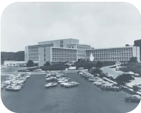
Madison Hospital Circa 1977

Jesus Christ exemplified a life of service. It is MTSA's desire to follow His pattern and honor the Bible, while exhibiting this through learning, scholarship, and ministry. For more information regarding the SDA church visit www.adventist.org .