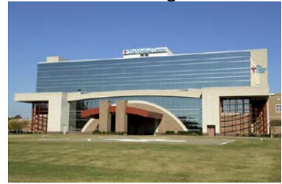
Bowling Green, KY

Growing from a 35-bed city hospital to a 490-bed regional healthcare system over the past 80+ years, the Medical Center & its affiliated hospitals offer South-central Kentucky the following services: comprehensive cardiac program including open heart surgery, obstetrics and neonatology, cancer treatment and orthopedic services.