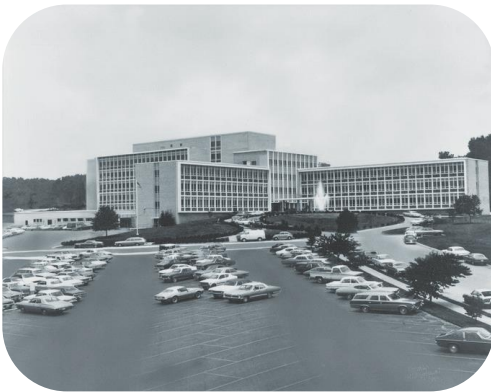
Madison Hospital Circa 1977

For more information regarding the SDA church visit - www.adventist.org .