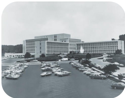
Madison Hospital Circa 1977

For more information regarding the SDA church visit - www.adventist.org .