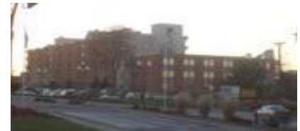
Bowling Green, KY

Growing from a 35-bed city hospital to a 490-bed regional healthcare system over the past 80+ years, the Medical Center & its affiliated hospitals offer South-central Kentucky the following services: comprehensive cardiac program including open heart surgery, obstetrics and neonatology, cancer treatment and orthopedic services.