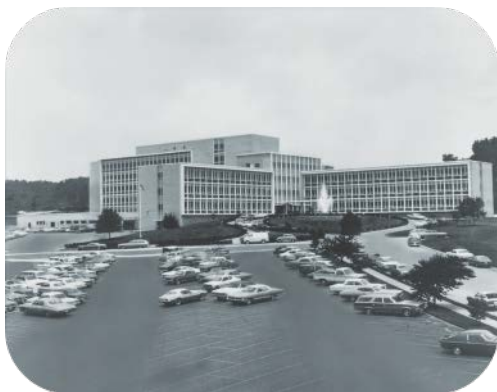
Madison Hospital Circa 1977

Jesus Christ exemplified a life of service. It is MTSA’s desire to follow His pattern and honor the Bible, while exhibiting this through learning, scholarship, and ministry. For more information regarding the SDA church visit www.adventist.org .