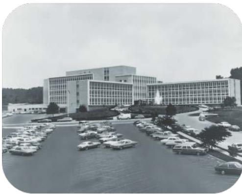
Madison Hospital Circa 1977

For more information regarding the SDA church visit - www.adventist.org .