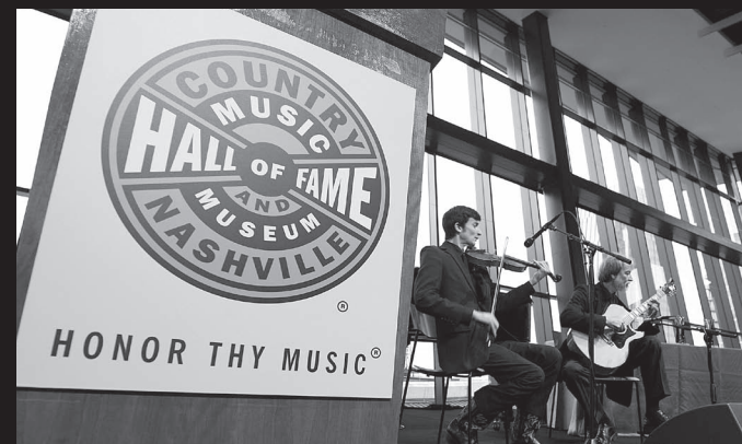
The Country Music Hall of Fame® and Museum will host the Second Annual MTSA Mission & Award Gala on May 7, 2015.