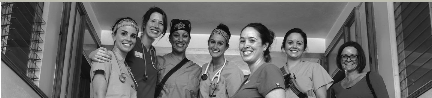
First day excitement for these MTSA mission team members is evident as they are pictured on the front steps of the hospital.

Nashville area. Most of the nurses at the hospital did not have their own stethoscope nor any experience using one. Therefore another aspect of the team's work was showing the nurses how to put the stethoscopes to good use with patients.