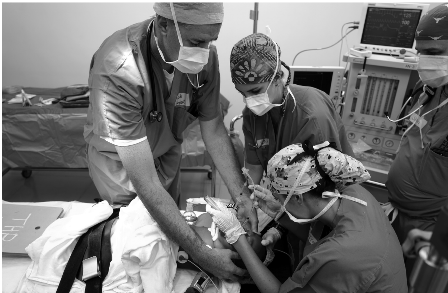
MTSA Haiti mission team members provide anesthesia in the Hopital Adventiste d'Haiti in Carrefour.

MTSA team provided anesthesia in 20+ advanced cases, led educational sessions with nurses