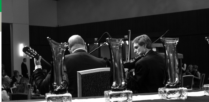
Musicians perform during the dinner hour to a backdrop of the glass icon awards to be presented at the 2016 Mission & Awards Gala.

Haiti is the poorest country in the Western Hemisphere, with 80% of its 10 million inhabitants living under the poverty line. In 2010, a massive earthquake struck near Port-au-Prince. And just two weeks prior to the MTSA mission team's arrival, Hurricane Matthew caused widespread devastation along the country's southwestern coast.