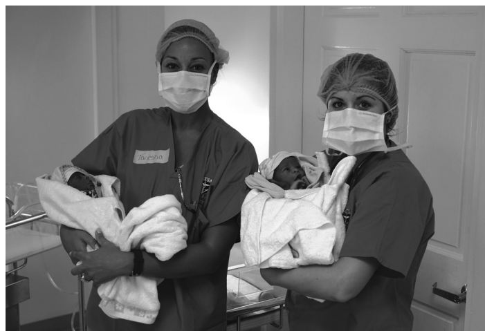
These two MTSA students are grinning ear-to-ear behind masks as they care for two newborns.