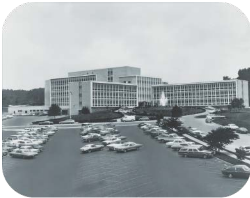
Madison Hospital Circa 1977

For more information regarding the SDA church visit - www.adventist.org .