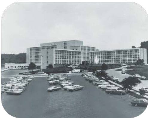
Madison Hospital Circa 1977

For more information regarding the SDA church visit - www.adventist.org .