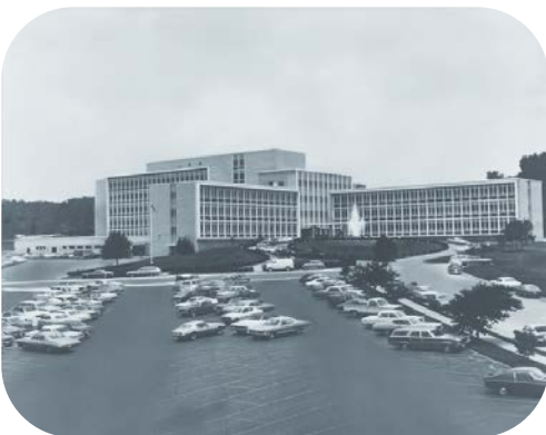
Madison Hospital Circa 1977

Jesus Christ exemplified a life of service. It is MTSA's desire to follow His pattern and honor the Bible, while exhibiting this through learning, scholarship, and ministry. For more information regarding the SDA church visit www.adventist.org .