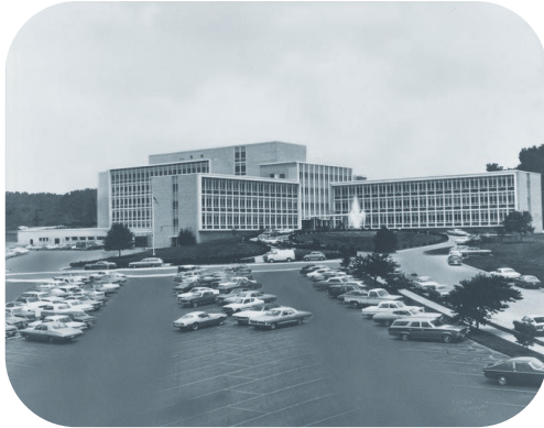
Madison Hospital Circa 1977