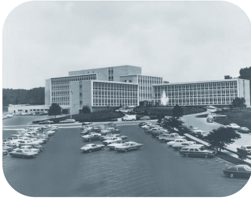
Madison Hospital Circa 1977