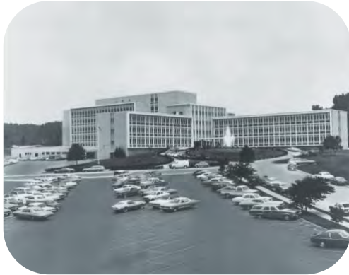
Madison Hospital Circa 1977