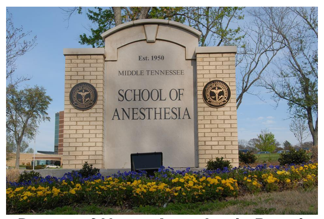
Doctor of Nurse Anesthesia Practice (DNAP) Completion Program