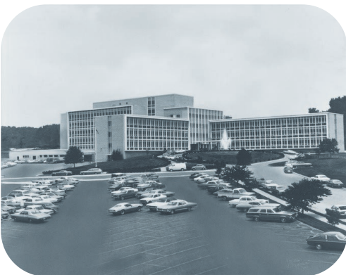
Madison Hospital Circa 1977

Jesus Christ exemplified a life of service. It is MTSA’s desire to follow His pattern and honor the Bible, while exhibiting this through learning, scholarship, and ministry. For more information regarding the SDA church visit www.adventist.org .