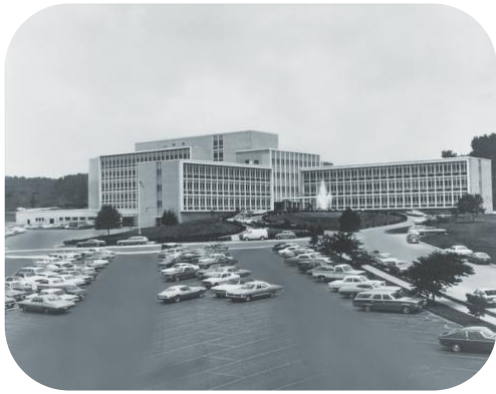
Madison Hospital Circa 1977