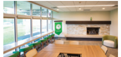
MTSA Campus Renovations Page 10