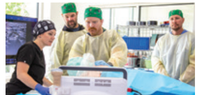
Programs and Workshops Page 6-7